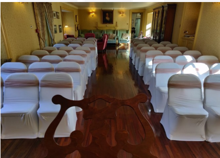
Long Room View 1

Our beautiful grounds are a wonderful backdrop for your photographs, whether it's down at our own private pier or underneath the canopy of our matured trees (a Shetland rarity!)