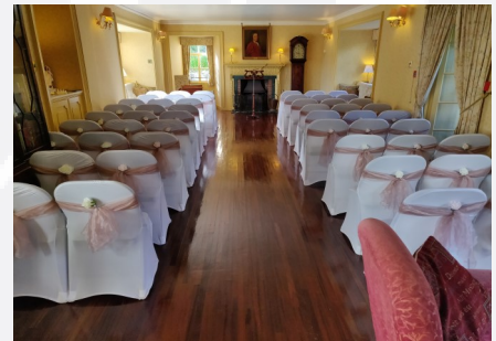
Long Room View 2

Our beautiful grounds are a wonderful backdrop for your photographs, whether it's down at our own private pier or underneath the canopy of our matured trees (a Shetland rarity!)